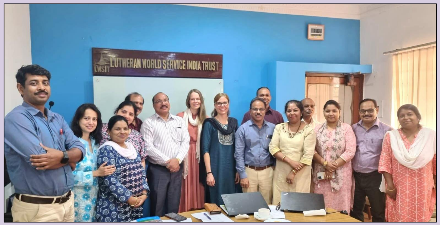
Visits of Normisjon and Digni Representatives to National office